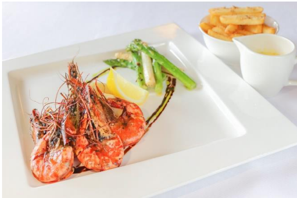
Gamberessa 44 Coastal Spiced Prawns, Truffle Fries, Grilled Vegetables, Lemon Butter Emulsion