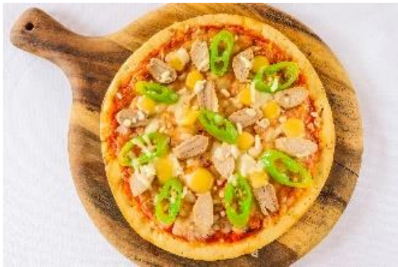
Tonno 24 Yellow Fin Tuna, Espelette Chilli, Manchego