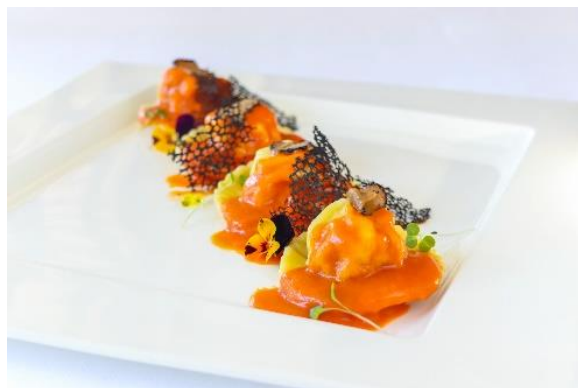
Ravioli di Crostacei Fatti in Casa 32 Butter Poached Lobster & Prawn Ravioli, Truffle Cream, Tomato Butter Emulsion