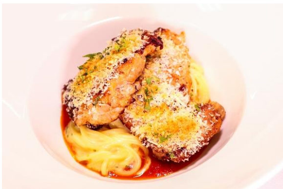
Pollo alla Parmigiana 26

Micro Greens, Lemon Wedge, Purple Potato Mash, Gastrique Sauce