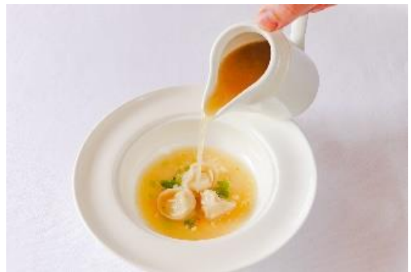
Brodo di Pollo 18 Healthy Chicken Broth, Chicken Tortellini, Basil Oil Trickle, Fresh Herbs