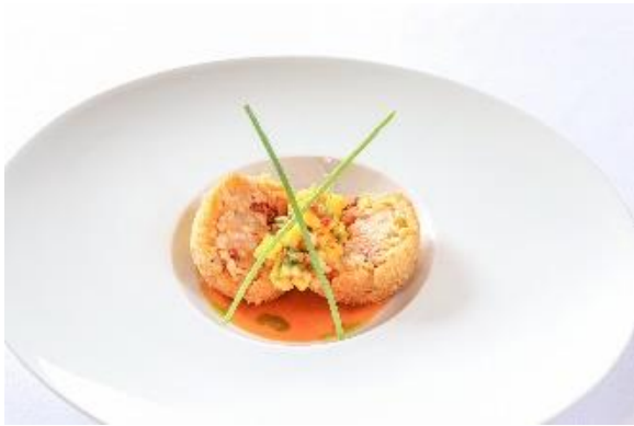
Arancini Di Gamberi 17 Sun-Dried Tomato, Butter Tossed Prawn, Creamy Lobster Butter Emulsion, Lemon, Chilli & Mango Salad, Basil Oil Trickle