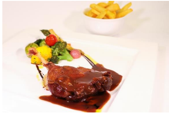
Petto d'Anatra 30 Confit Duck Leg, Grilled Vegetables, Truffle Fries, Cherry Wine Jus