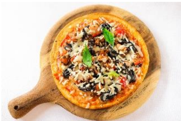
Frutti De Marre 26 Mixed Seafood, Squid Ink, Fresh Basil