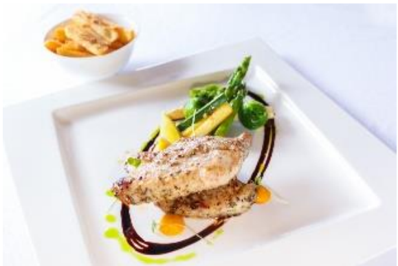
Pescato del Giorno 31 Maldivian Tuna, Garden Vegetables, Truffle Fries, Lemon & Orange Emulsion