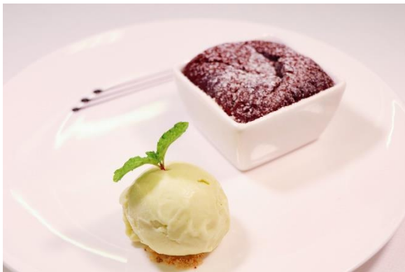
Molten Chocolate Cake 20 Avocado Ice Cream, Cardamom Crumble