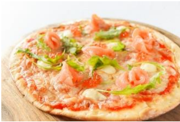
Pesce 26 Smoked Salmon, Fish Roe, Cream Cheese