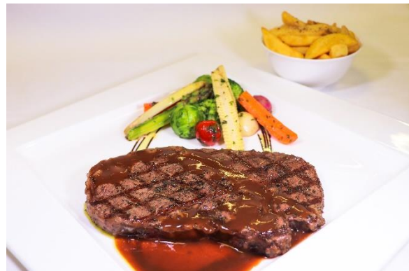
Costata di Manzo 69 Beef Ribeye, Grilled Vegetables, Truffle Fries, Wine Jus