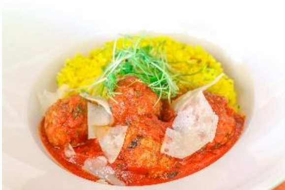
Polpette al Pomodoro 24

Herbed Meatballs, Buttered Saffron Pilaf, Parmesan Cheese, Basil Oil Trickle