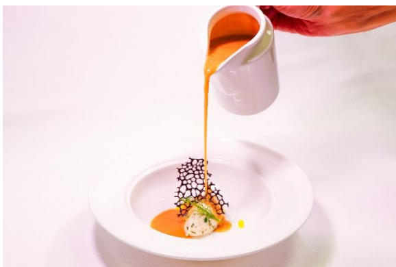
Bisque di Mare 20 Creamy Seafood Essence, Prawn Quenelle, Squid Ink Tuile, Basil Oil Trickle, Fresh Herbs