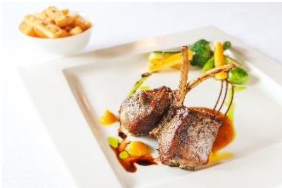
Costolette d' Agnello 32 Garlic Lamb Rack, Garden Vegetables, Truffle Fries, Wine Jus