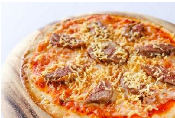
Anatra 28 Duck Confit, Porcini, Scarmoza