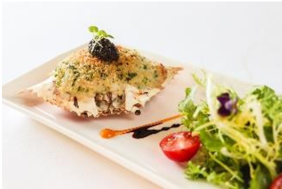
Granchio al Forno 24 Baked Crab, House Salad