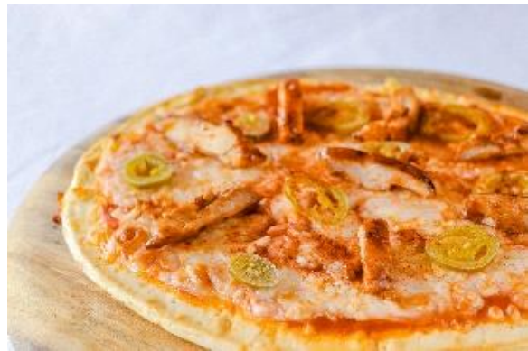
Pollo 24 Barbeque Chicken, Smoked Paprika, Jalapenos