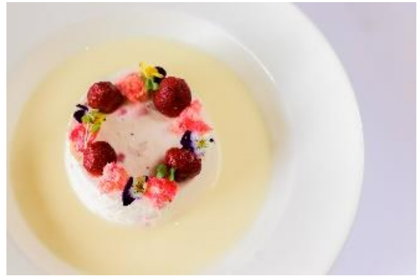
Torta Tres Leches 15 Vanilla Strawberry Cream, Sponge, Fresh Berries