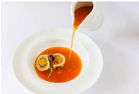
Zuppa Di Agnello Alla Pugliese 20 Ground Herbs, Pulled Roast Lamb & Ricotta Cheese Tortellini, Basil Oil Trickle