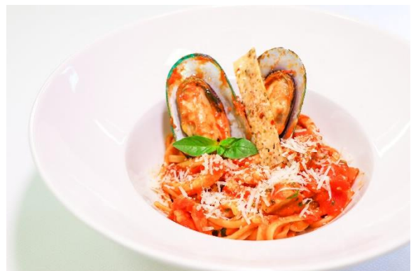
Linguini Marinara 25 Tomato & Fresh Seafood, Parmesan Cheese, Basil Oil Trickle, Fresh Basil