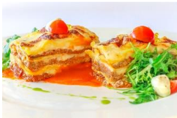
Lasagne di Manzo 30 Beef Ragout, Tomato, Mozzarella Cheese