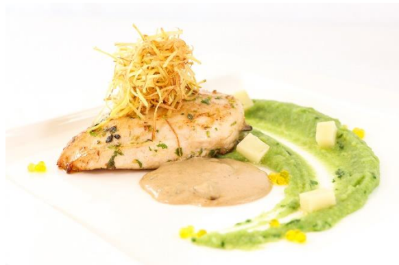
Pollo Ripieno 24 Mushrooms & Truffle Stuffed Chicken Breast, Spinach Polenta, Thyme Infused Confit Potato, Crispy Fried Leeks, Wine Jus, Basil Oil Trickle