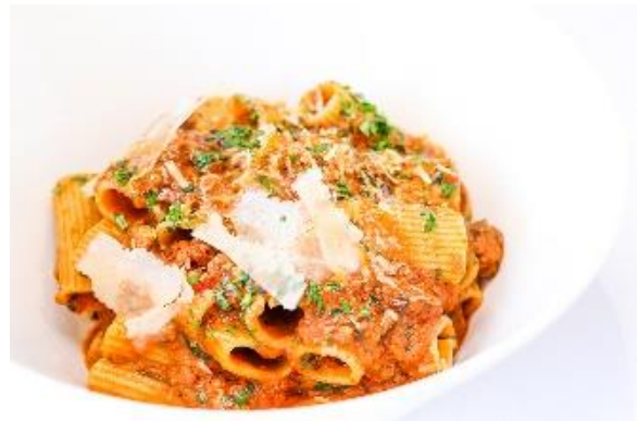
Rigatoni Bolognese 25 Beef & Tomato, Beef Jus, Basil Oil Trickle, Parmesan Cheese, Fresh Basil