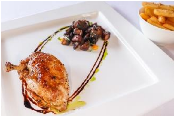
Polla al Marsala 27 Chicken, Tossed Mushrooms, Truffle Fries, Red Wine Sauce