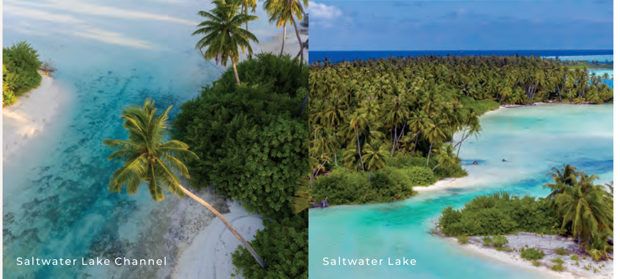
Saltwater Lake Channel