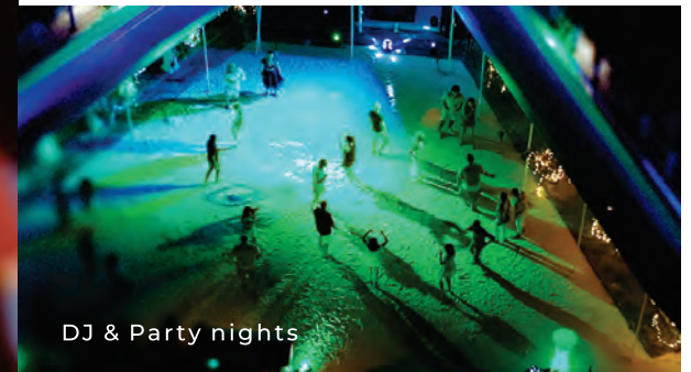
DJ & Party nights

Experience the untouched beauty of Laamu through a nature walk, wandering through lush landscapes and encountering unique flora and fauna. And as the day transitions to night, let loose under the Maldivian sky at Dhirun'Bar with electrifying beats, and then head to Ko'Bar for a sundown session, where tunes harmonize with breathtaking views. Your nights at Rahaa promise to be unforgettable.