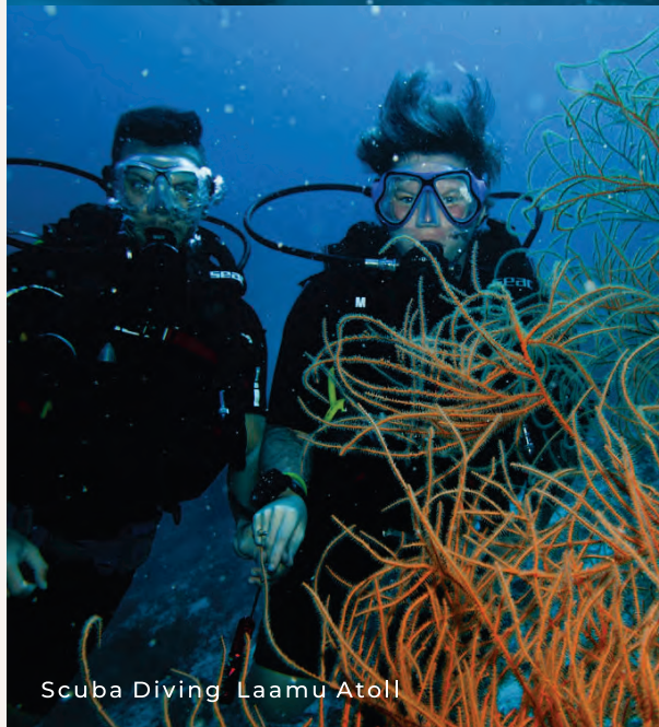
Scuba Diving Laamu Atoll