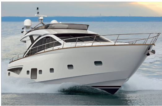
M66 – Luxury 66ft yacht