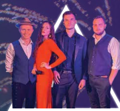
StaySee Band Ukraine