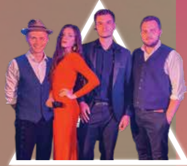
StaySee Band Ukraine