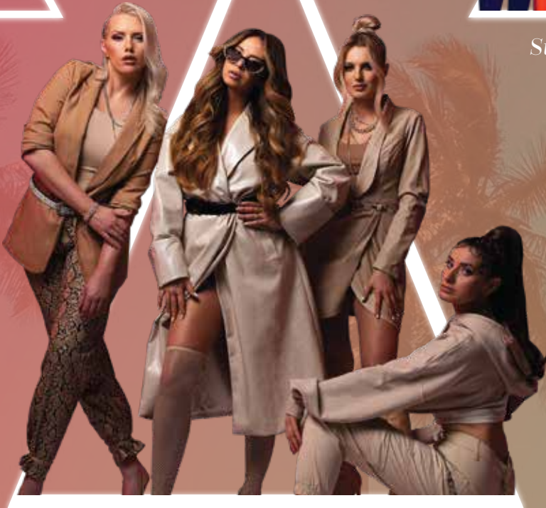
Electric Girls Band Poland