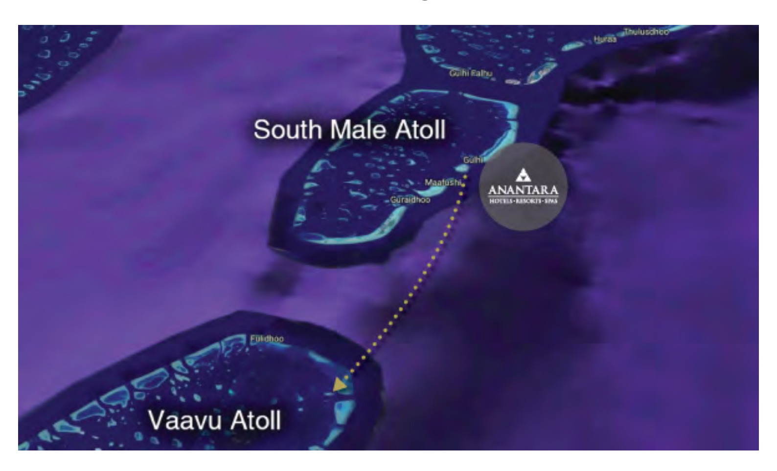
Whale Shark Snorkeling in Ari Atoll