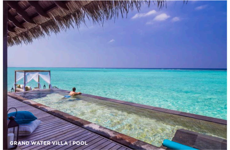
GRAND WATER VILLA | POOL