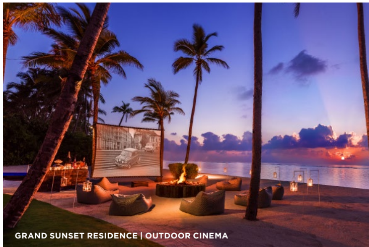
GRAND SUNSET RESIDENCE | OUTDOOR CINEMA