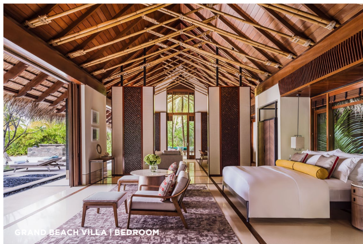
GRAND BEACH VILLA | BEDROOM