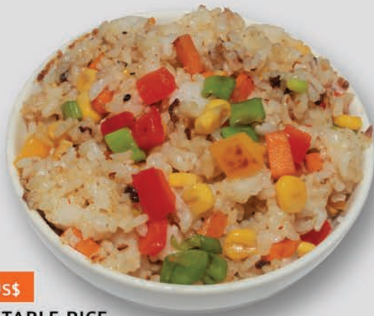
10us$ VEGETABLE RICE V