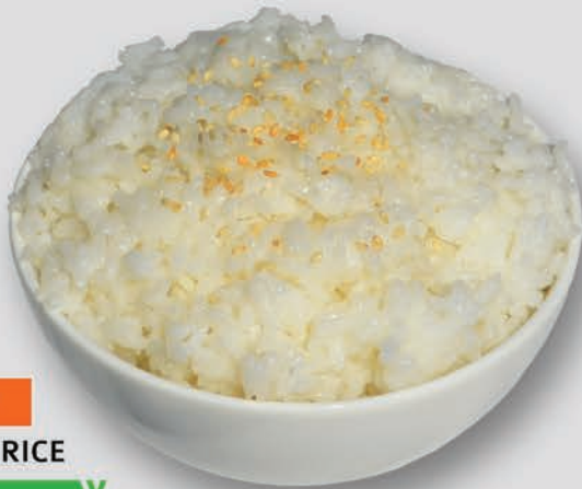
5us$ PLAIN RICE V