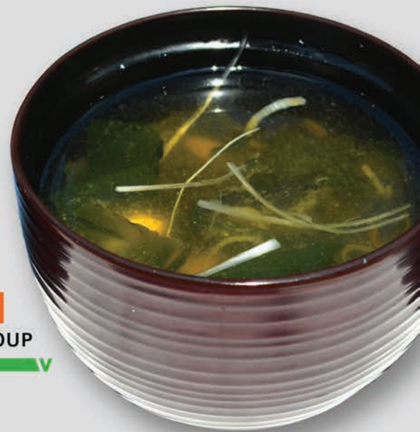
7us$ MISO SOUP V