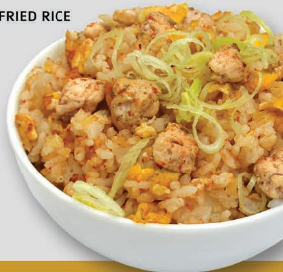
16us$ CHICKEN FRIED RICE