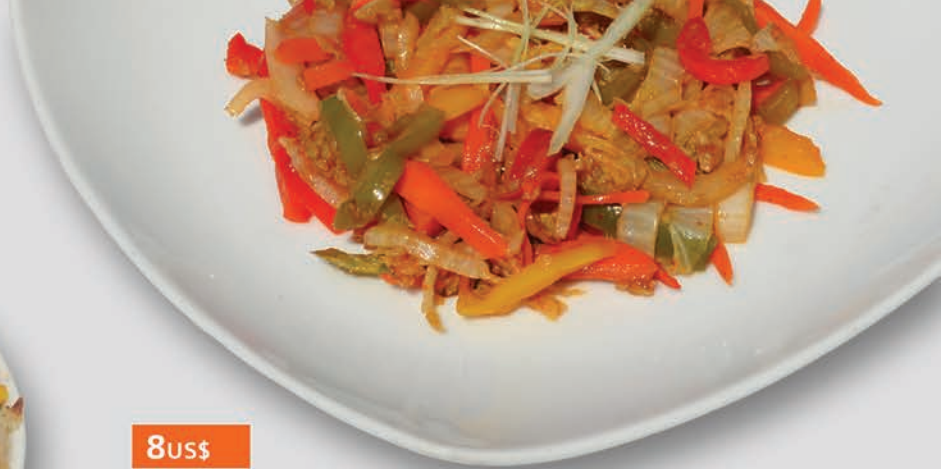
8us$ MIXED VEGETABLES V