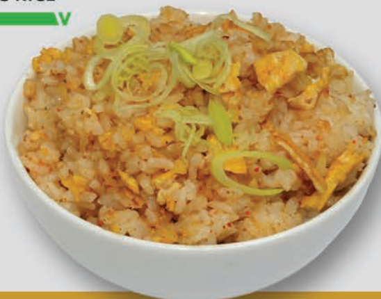
8us$ GARLIC RICE V